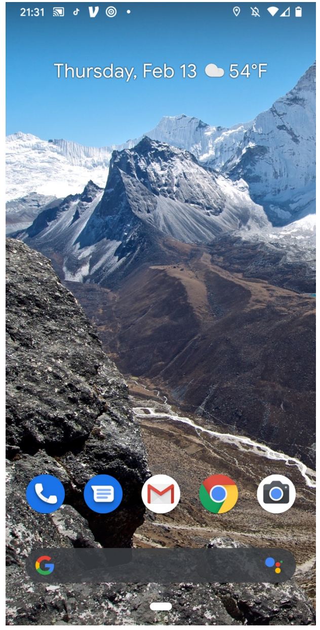
Figure 1 – Home Screen 1.

Screenshots of the home screens. Figure 3 contains a folder that is on screen 2.