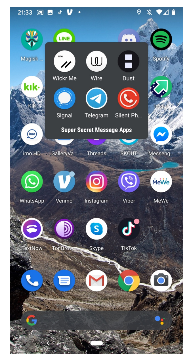
Figure 3 – Home Screen 2 with exposed folder.