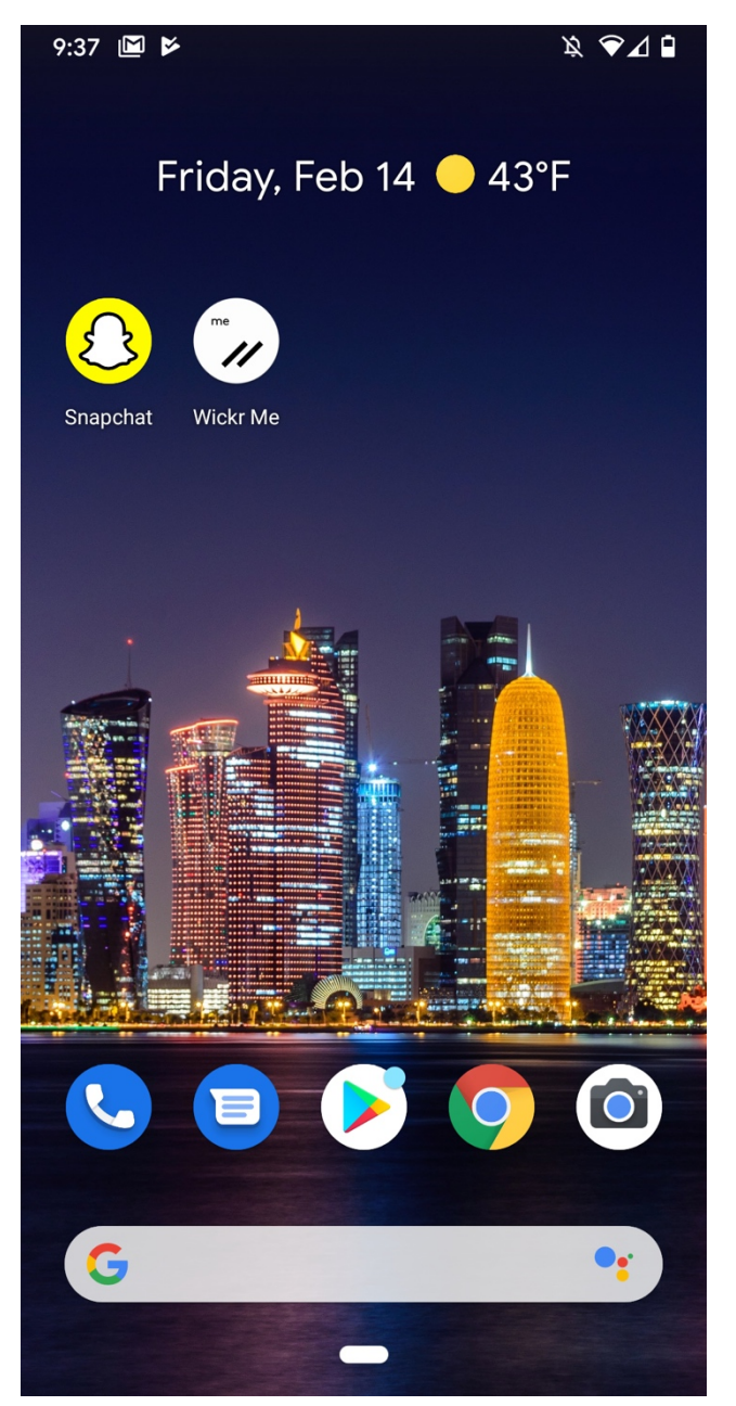
Figure 4 – Home screen for User 2.

Screenshot of the home screen for account User 2.